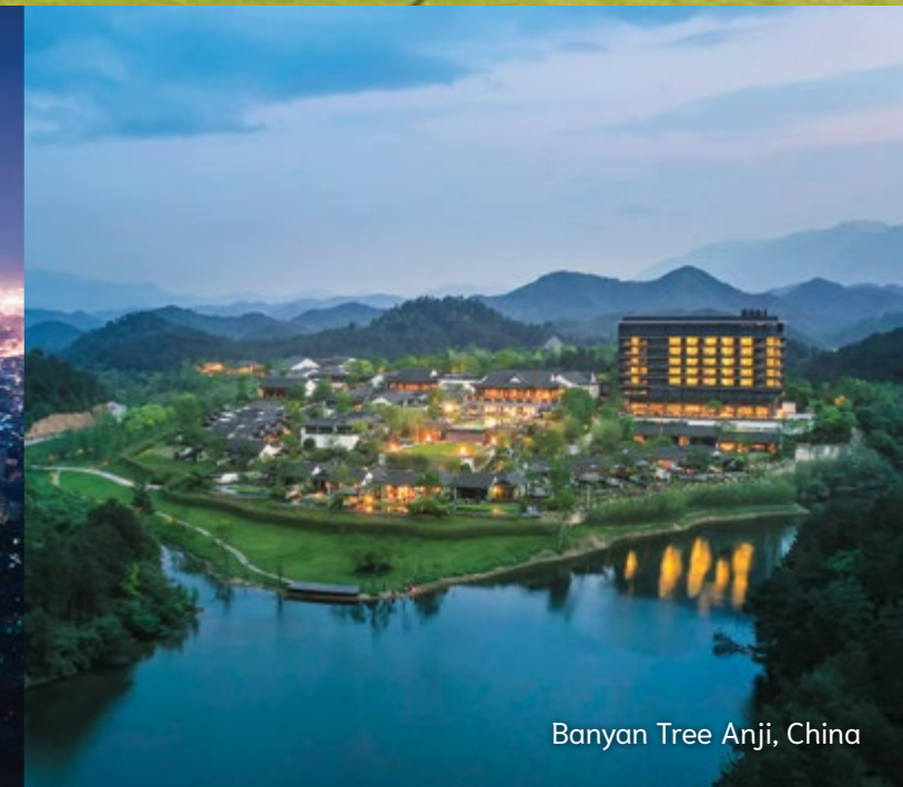
Banyan Tree Anji, China