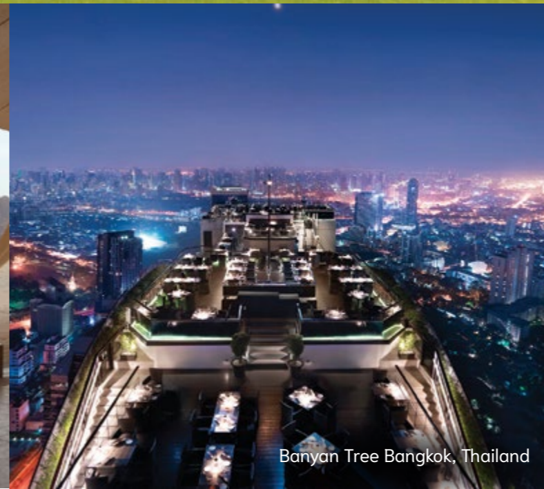
Banyan Tree Bangkok, Thailand