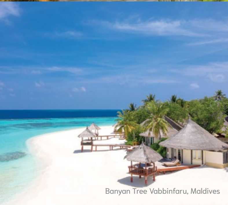
Banyan Tree Vabbinfaru, Maldives