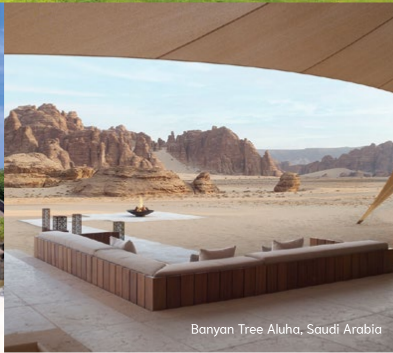
Banyan Tree Aluha, Saudi Arabia